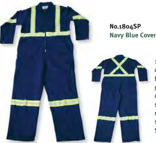
Navy Blue Coverall

100% cotton coverall. 4 front pockets and 2 back pockets. 2 1/4" grosgrain tape c/w 3/4" 3m silver industrial reflective tape. Sizes XS-XXXL.