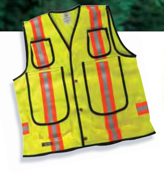
Poly/cotton lime green safety vest. C/w 6 front pockets and 2 inside pockets. 2 1/4" 3m reflective tape. Meets W.C.B. standards. Sizes S-XXXL.