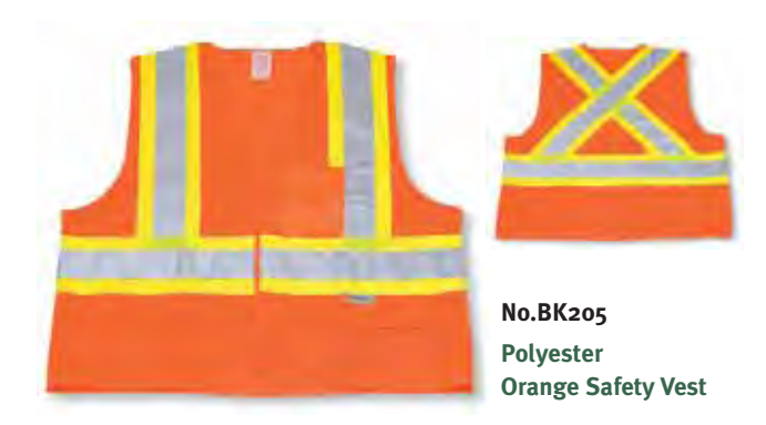
100% Polyester org safety vest. C/w 2 bottom pockets and breast pocket. 4" 3m reflective tape. Meets CSA Z96-o2 class 2 level 2. Sizes S/M, L/XL, XXL/XXXL.

100% polyester lime green safety vest. C/w 2 bottom pockets and breast pocket. 4" 3m reflective tape. Meets CSA Z96-o2 class 2 level 2. Sizes S/M, L/XL, XXL/XXXL.