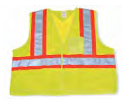
No.222LM MESH Lime Green Poly/Cotton Surveyor/Supervisor Safety Vest with Full Mesh Back