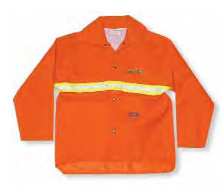
No.0700 Orange Heavy Duty Rain Jacket

Heavy duty deluxe Rainforest Raingear is tough, made out of 400 denier & 100% waterproof nylon with polyurethane backing.