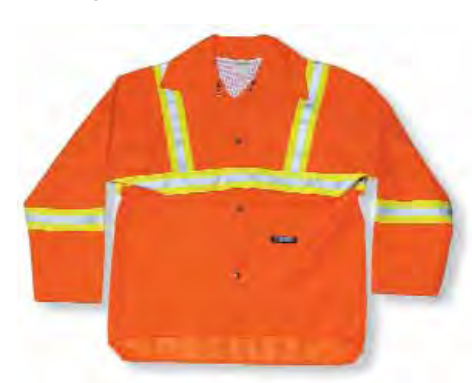
No.o7ooSP Orange Hi-visable Heavy Duty Rain Jacket

400 denier, all double shoulder and double sleeves. Back vent with mesh. One front breast pocket. Heavy duty brass snap. Front storm flap. One row of 2 1/4" 3m reflective tape . All stress points are bar-tacked for extra strength. Sizes S-XXL.