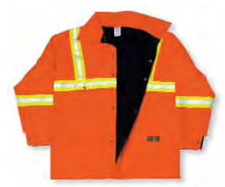
No.777SP 400 Orange Hi-visable W.C.B. Heavy Duty Rain Jacket with Fleece Lining

400 denier, all double shoulder and double sleeves. One breast pocket. Front storm flap. Heavy duty brass snap buttons. 2 1/4" 3m reflective tape. Dual reflective stripes for outstanding day or night visibility. All stress points are bar-tacked for extra strength. Sizes S-XXL.