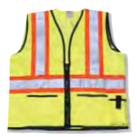
tape. Meets CSA Z96-o2 class 2 level 2. Sizes S-XXXL.

100% poly orange safety vest. C/w 2 bottom pockets and radio pocket. Zipper front with tear away shoulders. 4" 3m reflective