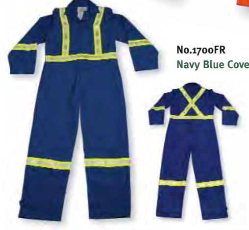
Navy Blue Coverall

100% cotton overall 4 front pockets and 2 back pockets. 2 1/4" grosgrain tape c/w 3/4" 3m silver industrial reflective tape. Sizes XS-XXXL.