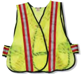
No.BK10 Lime Green Safety Vest

100% Polyester mesh vest. C/w 2 1/4" 3m red reflective tape. One size.