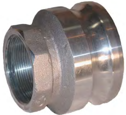
Special Type 'A' adapter with 2 inch female threads