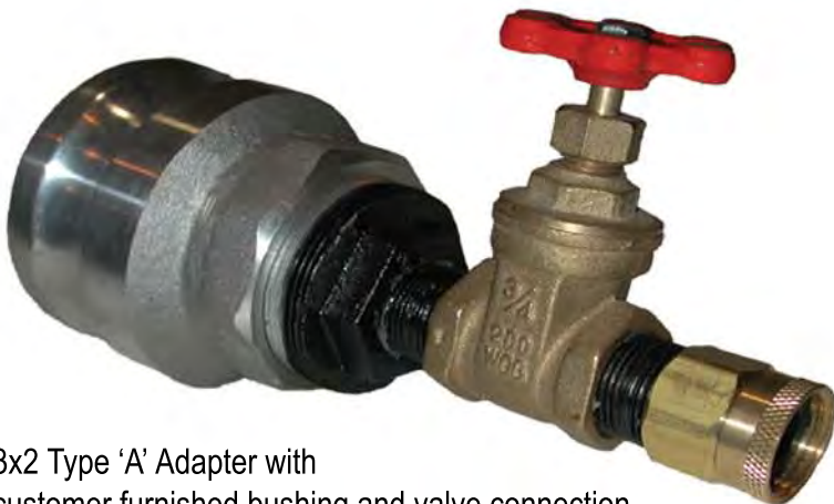
3x2 Type 'A' Adapter with customer furnished bushing and valve connection.

The 3x2 adapter is all you need, If your requirements call for connections less than 2 ½" NST.