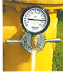
Gauge Care Guidelines