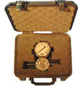
Order SUK01001 Carrying Case for P670 Series